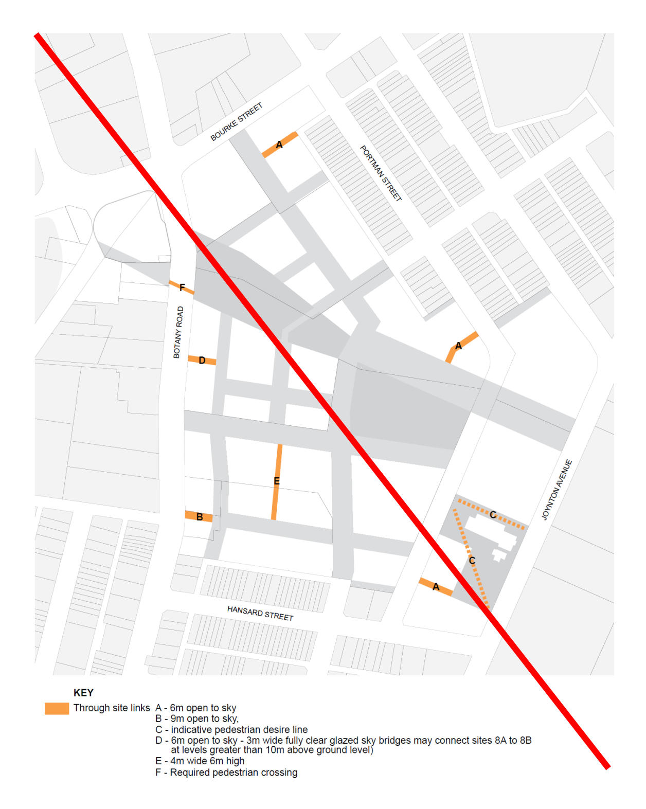
Figure 3.27 Through-site links and arcades (Existing graphic below proposed to be deleted and replaced)